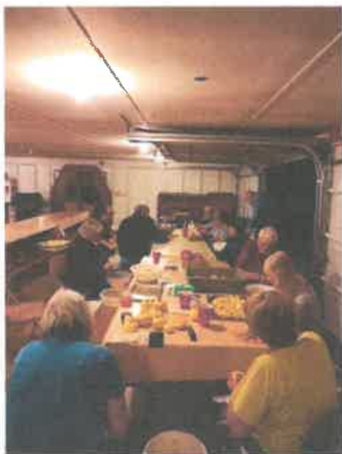
Below: The finish prep table, where the apples are cut and readied for the Kettles.