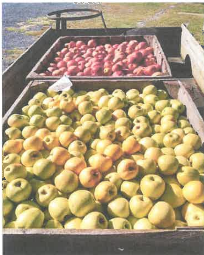
There are approximately 2500 apples per bin. The apple peelers started at 1 and finished around 8:30 that evening.

The apples were brought in and peeled on October 11, then they were boiled into Apple butter on the 12 th . 60 gallons of apple butter was made. The money raised for this will go towards outreach.