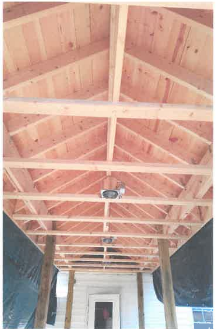
They are coming along with the roof over the side walk entrance to the Sunday School