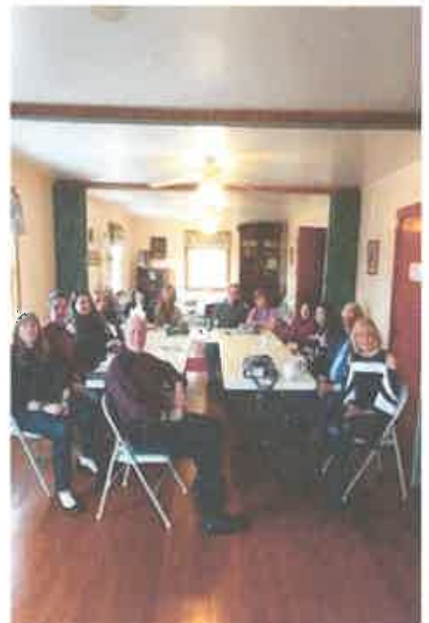
Right: Come and learn the Bible with us, at Sunday School we meet @ 9:30 Refreshments provided All are invited to attend