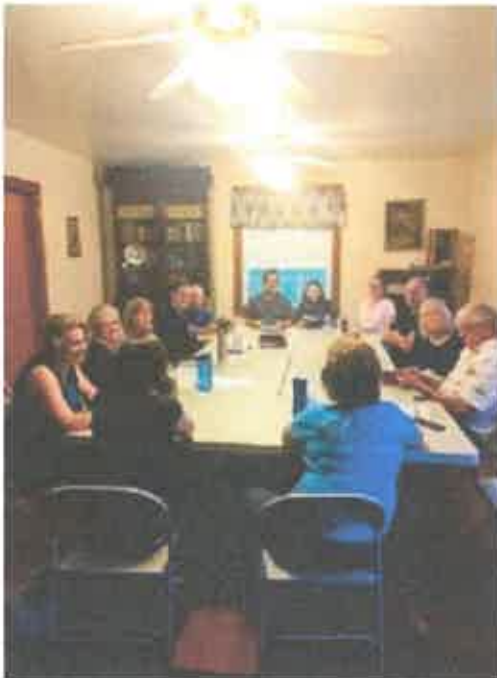
Left: Luther's Large Catechism Class meets on Monday's @ 7pm All are invited to attend.